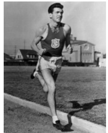
Louis Zamperini. Restless young man, U.S. Olympic runner, war hero, and sinner in need of grace who helped to define the era of Billy Graham (early publicity photo)

Institute. Graham found in the Institute everything he had not found at Bob Jones. From here he got some teachers who became lifelong friends. Along with the instructions, practical lessons on evangelism were also given outside the campus. Florida Bible Institute was the place that molded and made him a preacher. During this period, he was roaming across the streets preaching gospel. He normally drew a good crowd of a few hundred even in Trailer Parks. He became a common sight in the street corners of the cities nearby. In the nearby city Tampa, on a Sunday, he used to preach seven times at least. At times, he was opposed by people and was physically assaulted, but never ceased to preach the