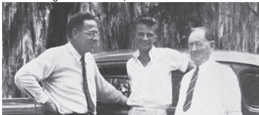
Young Billy Graham