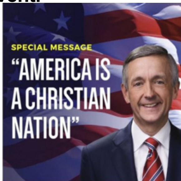
DR. ROBERT JEFFRESS SENIOR PASTOR

Outspoken Pastor Robert Jeffress has shot back at Dallas Mayor Mike Rawlings, accusing him of being "hostile" toward his megachurch by speaking out against a billboard advertising an upcoming sermon on how "America is a Christian Nation." Jeffress' First Baptist Dallas has been the center of media attention in the last couple of weeks after the Dallas Morning News published an op-ed that was critical of billboards promoting a June 24 service at First Baptist Dallas that will feature a special message in which Jeffress will outline the historical evidence that America is a Christian nation.