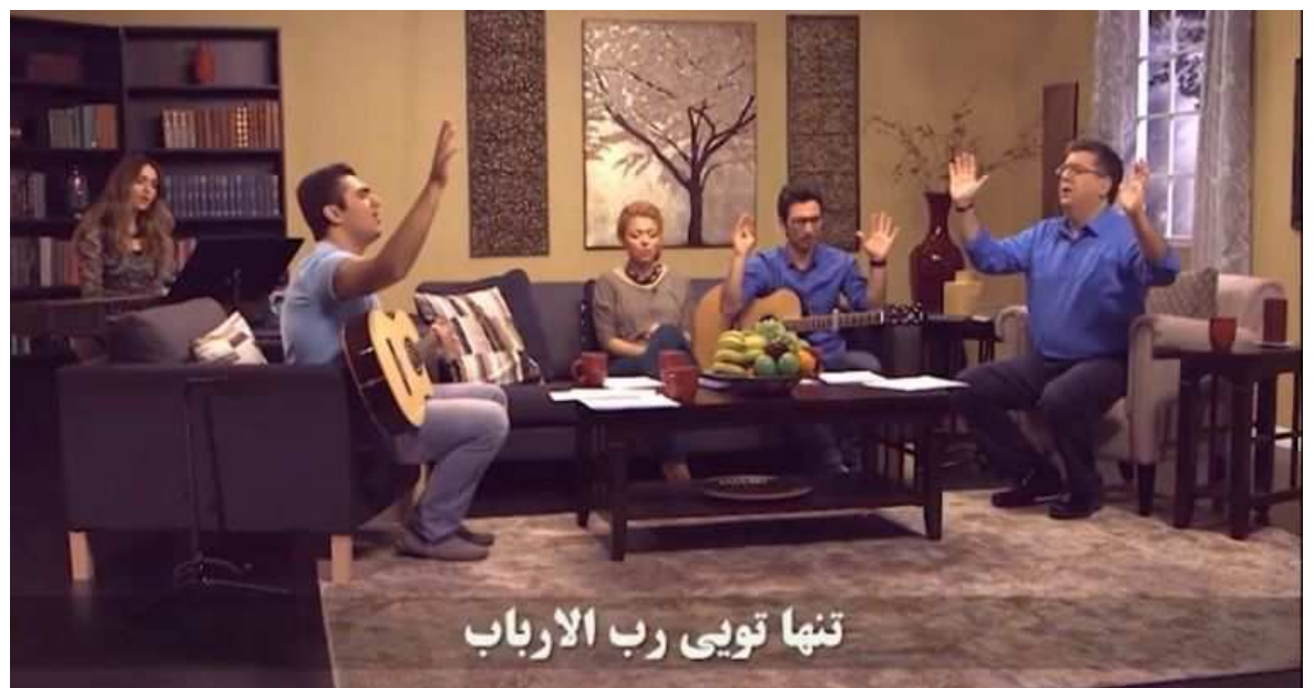
Iranian Christians in a video shared by Heart4Iran Ministries.

"I would say there's a 10 percent Iran and a 90 percent Iran. Ten percent control the country in a more oppressive manner, hardline, religious manner and then the majority of the people, 90 percent of the people love America.