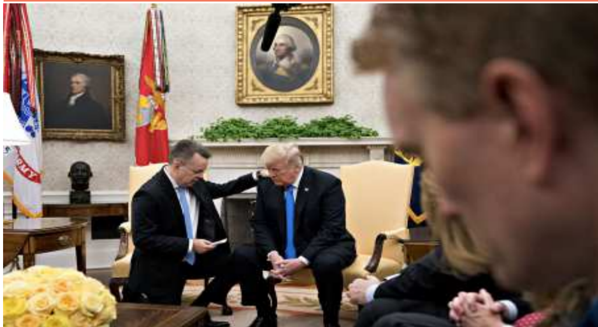
Andrew Brunson prays with President Trump in October on the day he returned to the United States.

Andrew Brunson, the American pastor who spent 735 days in a Turkish prison before being released last fall, admitted in his new book that he seriously contemplated suicide during his incarceration. Brunson made the admission in his