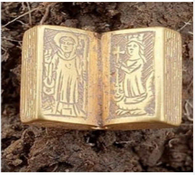
the Middleham Jewel. Some believe that these two pieces could have been made by the same anonymous artist in the 15th century. The Yorkshire Museum is currently appraising Bailey's discovery, but it is predicted to be worth at least £100,000 (approximately $134,150).

King Richard III (1452–1485) used to own land near the location of the object's discovery, leading historians to believe that the artifact could have been owned by a female relative of his. Furthermore, the level of detail in the miniature bible has been compared to another gold pendant found in the area, called